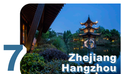
Zhejiang Hangzhou Banyan Tree Hangzhou

Modern interpretation on oriental elegance