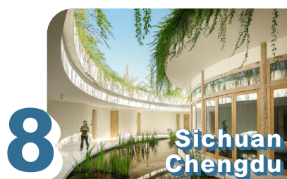
Sichuan Chengdu Six Senses Qing Cheng Mountain

Modern interpretation on oriental elegance