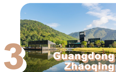
Guangdong Zhaoqing White Swan Resort Green Bay

24-hour featured concierge service and to enjoy natural radon hot springs