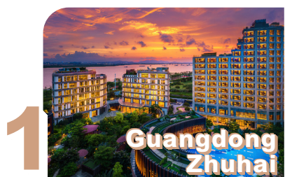
Guangdong Zhuhai Serensia Woods Hotel

Large scale wellness resort with five-star healing experience