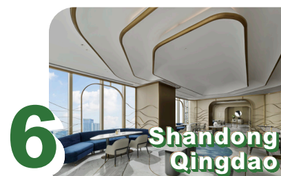
Shandong Qingdao MGM Qingdao

Panoramic view of red tiles and greenery coastline