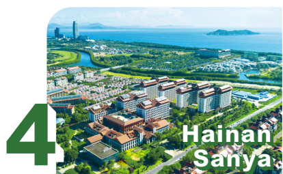
Hainan Sanya Haitang Bay Health Valley Resort

Living by the sea with beautiful environment