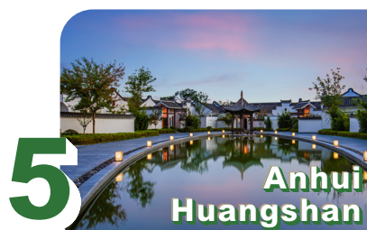
Anhui Huangshan Banyan Tree Huangshan

Living by the sea with beautiful environment