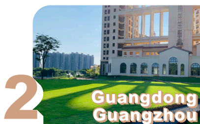
Guangdong Guangzhou Conghua Sunny Home

Large scale wellness resort with five-star healing experience