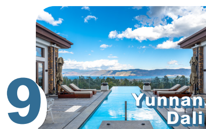
Yunnan Dali Honor Resort Yun Shu

Surrounded by green mountains, perfect place for retreat